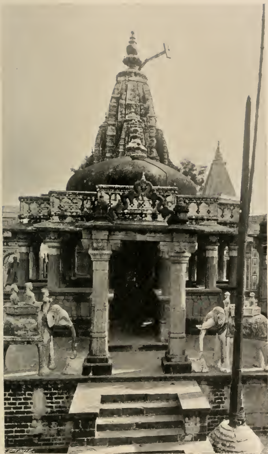
THE ELEPHANT A TEMPLE WARDEN.